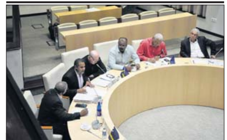
The two public sector unions ABVO (civil servants) and SAP (police staffers) in Curaçao held an urgent meeting with the Central Committee of Parliament. They want to see changes in the draft new pension regulation for government employees submitted by the Whiteman Cabinet before it's approved. The transition arrangement and payment of the employer's share of BVZ premium for those who choose to keep working until the age of 65 are among the still contested issues.

A presentation will be made to Leverock and her family on Saba, in the second week of January 2016; the funds raised will be announced then.